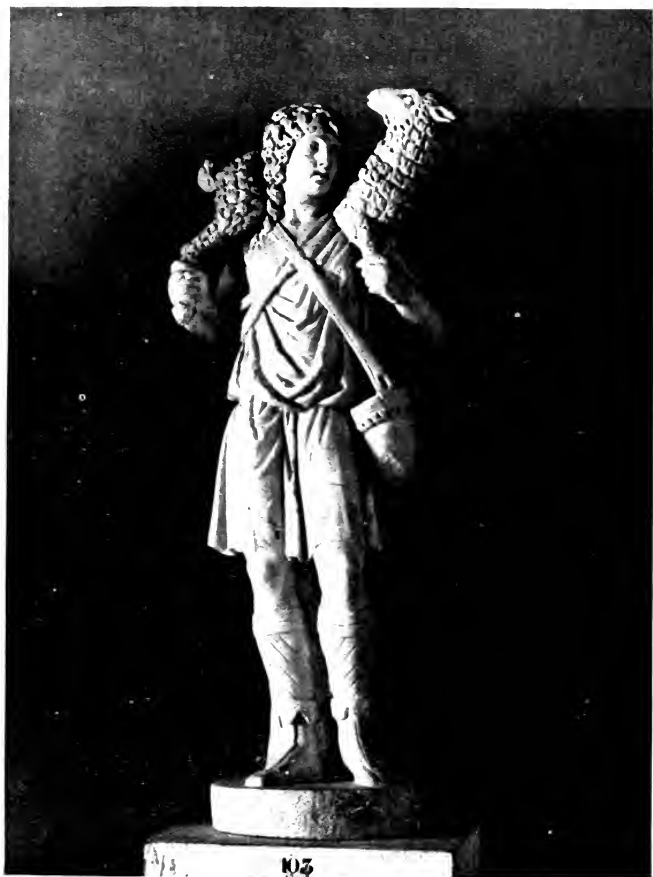
CHRIST AS THE GOOD SHEPHERD